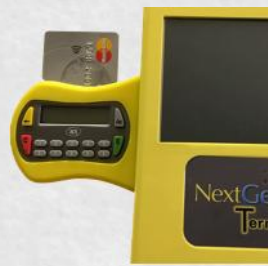
Secure PIN Entry Module